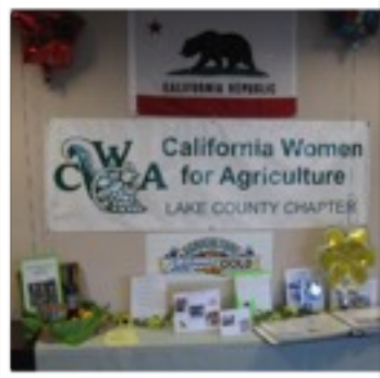
CWA Display at Umpqua bank designed by Karen Hook