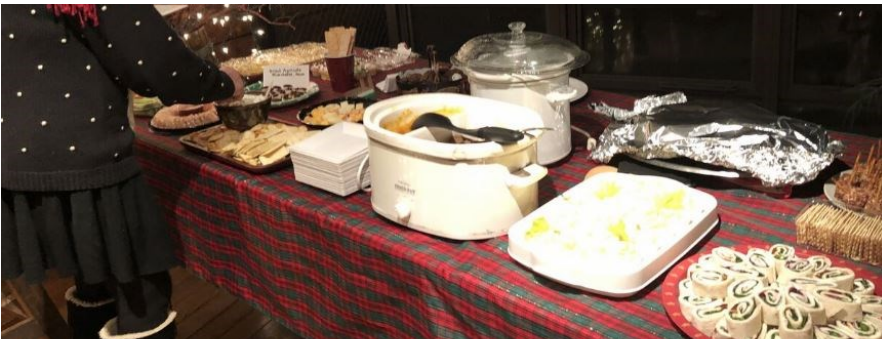
The fabulous banquet table!