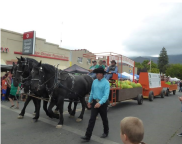
LCFB Float at Pear Festival

Merry Christmas and Happy Holidays from the Lake County Farm Bureau office!