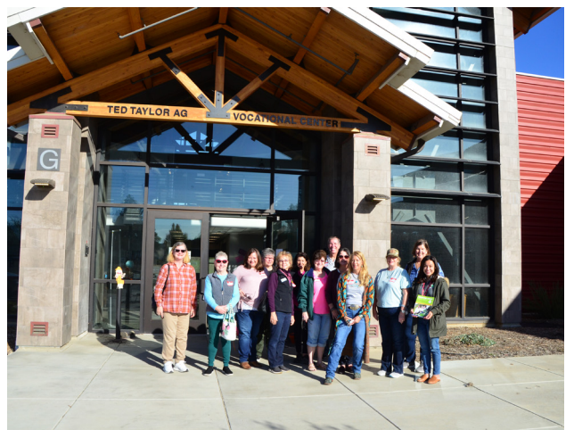
Above photo: Rancho Cielo tour attendees were impressed by the alternative educational facilities for disadvantaged youth.