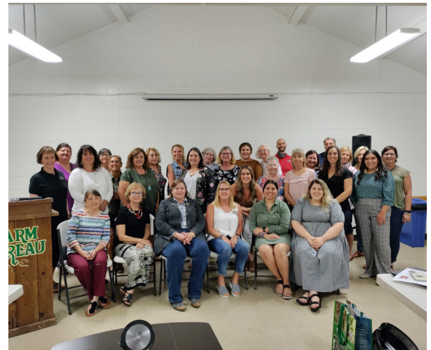
Below: Madera County Farm Bureau meeting hall allowed us to gather together for our Statewide Meeting.