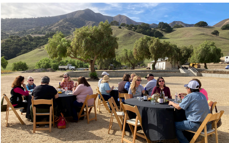
Left: Our CWA members enjoying lunch at Rustique Winery.